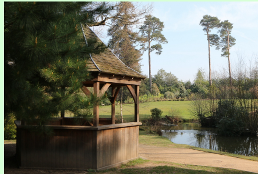
Our beautiful summerhouse